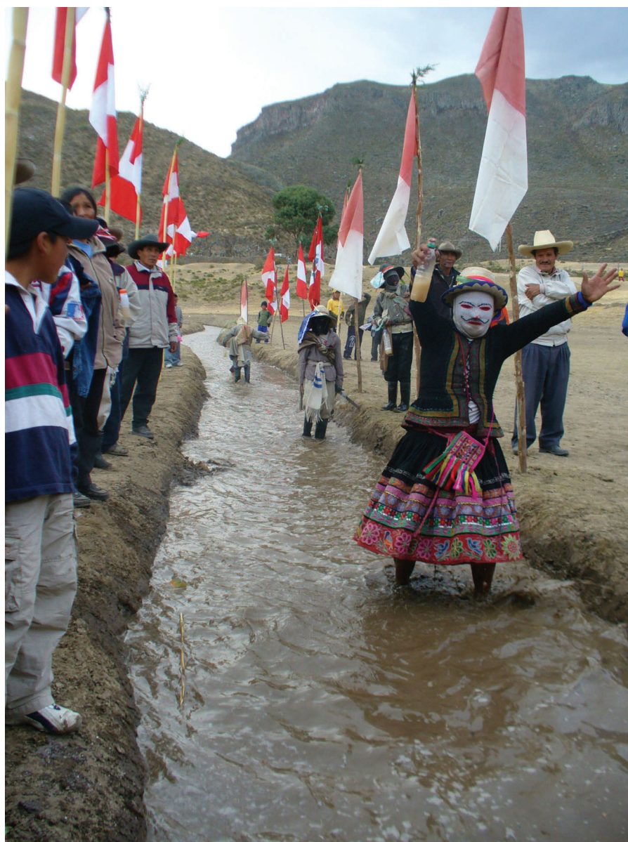
FIGURE 3 Water management in Coporaque includes many customary practices that play a key role in reproducing local water rights, alongside the standardized rules of the Water User Association.

with local preferences in irrigation management, still runs across the communities of the Colca Valley. As shown here, the nature of struggles to claim water and take-up of new water governance rules and recommended irrigation practices do vary across the Colca Valley, and these differences demonstrate the ethno-politics of water governance emerging alongside the state Water Law (Vera 2011). Ethno-politics show us the processes by which communities, while still maintaining their collective identity, increase their security of water supply not only through conflictive processes of cultural politics or frontal resistance, but also through alternative and creative processes; whereby people appropriate, adapt