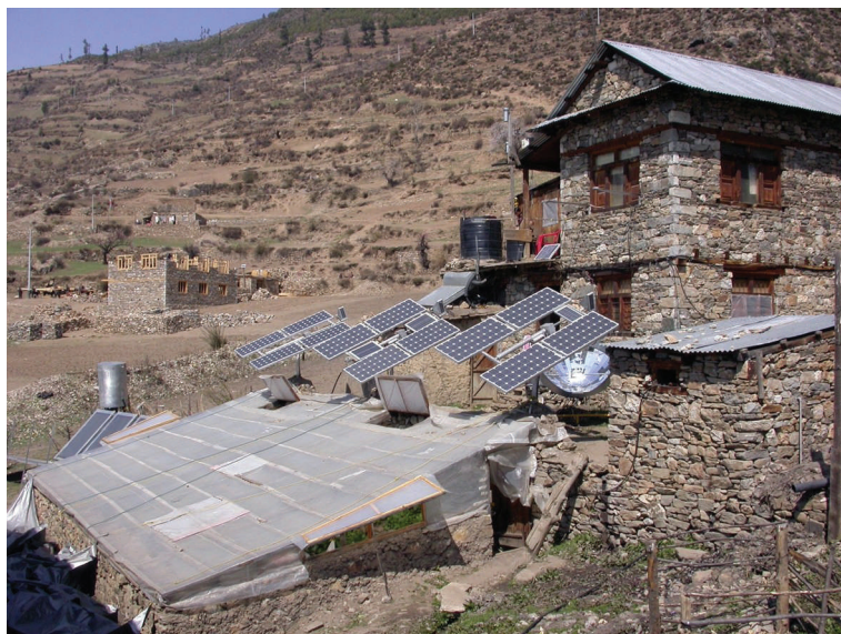
FIGURE 3 External view of HARS Greenhouse.

its expansion to the “Family of 4 PLUS,” which includes health and food supply initiatives. As part of the latter, RIDS-Nepal has constructed a number of greenhouses in Humla. Their first greenhouse, built in 2004, is located at their High Altitude Research Station (HARS) in Simikot, the main town of Humla (3000 m altitude).