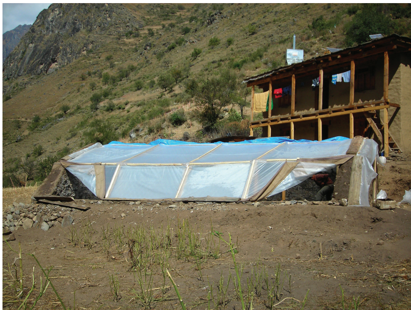
FIGURE 4 GERES-style greenhouse at Dharapori.

on measured hourly climatic data for 1 week in November. The validated model was then used to investigate options to improve the thermal performance of the greenhouse. The measurements showed that, in mid January during the night time, the subsurface soil temperatures within the greenhouse were approximately 7–9°C warmer than at a similar soil level outside. At 600 mm below the surface, the soil temperature in the greenhouse did not fall below 10.3°C. Air temperatures within the greenhouse in mid January were approximately 7.5°C above the outside air temperature. Although not ideal, the measurements over the winter months indicated that the growing conditions were certainly suitable for some vegetable crops such as spinach, carrots, and beans.