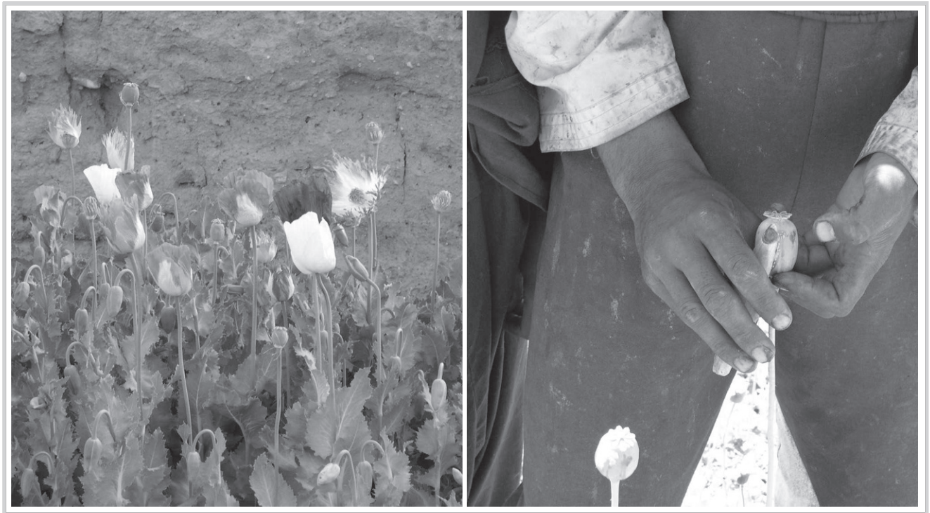
FIGURE 2 Opium poppy growing and harvesting in Badakhshan in 2006.

economically," "coping," or "declining" (Pain 2010: 27). Out of the 24 households, 3 had prospered (Table 2) since 2002. Another 3 had managed to cope, broadly maintaining their economic position. The majority (18) had seen a decline in their economy, indicative of the precariousness of life in the province.