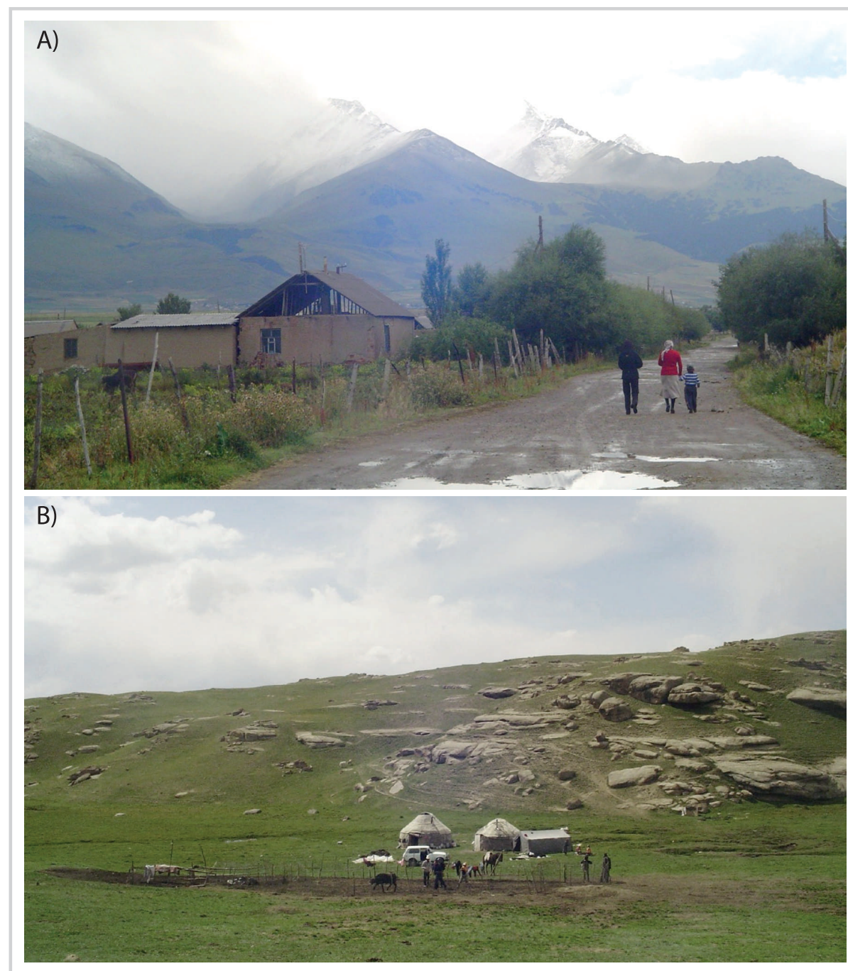
FIGURE 2 (A) Intensive pastures near Akmuz village and the Naryn Too range, September 2009; (B) Sheep pen and yurt on summer pasture.

pastoralist is 44.86 ha (Kulov 2007: 4), the highest in the country.