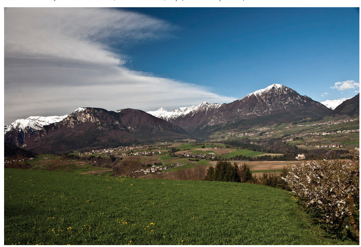
FIGURE 1 The valley of Giudicarie Esteriori, Province of Trento, Italy.

flourishing tourist industry on the lake, the provincial administration decided that something had to be done about the environmental pollution due to the local intensive dairy farming.