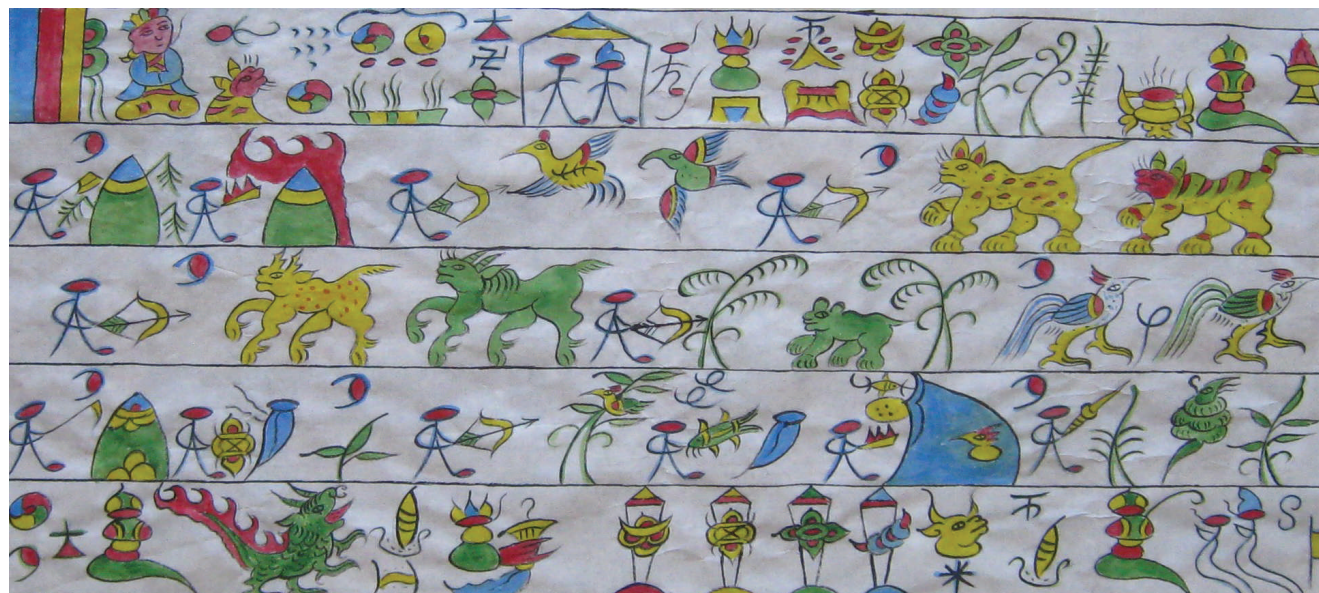
FIGURE 3 Contemporary pictograph script depicting environmental management through worship of the Nature God, created by a Dongba priest in Lijiang, China.

worship ceremony for the Nature God. The Dongba is illustrated on the upper left corner of the pictogram and chants,