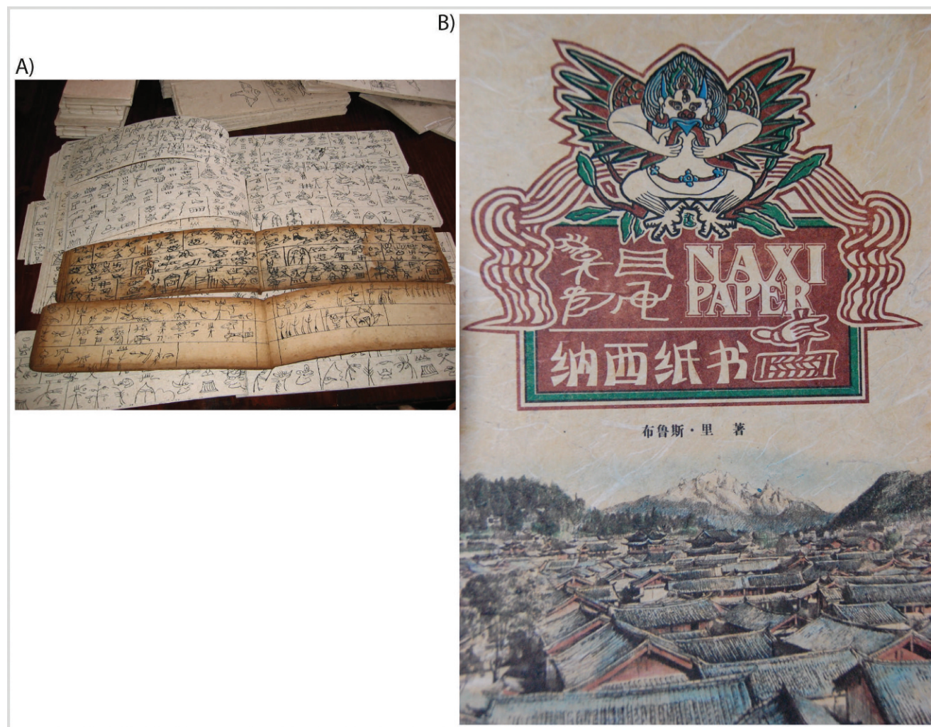
FIGURE 2 (A) Traditional Dongba papermaking. (B) Commercial Dongba papermaking.

that produce paper in the community, all interviewed households have knowledge of the habitats, types, traditional processing, and use of W. delavayi resources. Other than for papermaking, informants in Kenbeigu manage W. delavayi resources in their land use schemes for medicine and as a natural pesticide that grows in their home gardens and fields.