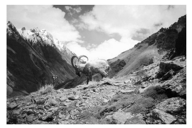
FIGURE 2 A Siberian ibex standing next to one of a pair of camera traps along a ridgeline.

the government (Braden 1984). The reserve was established for the protection of the alpine ecosystems of the Tien Shan and the rare species that occur there (specifically the snow leopard and the argali [ Ovus ammon ]). No hunting is permitted in SaryChat, although there are several villages located along the border, and extensive poaching by rangers and local villagers was previously reported (Koshkarev and Vyrypaev 2000).