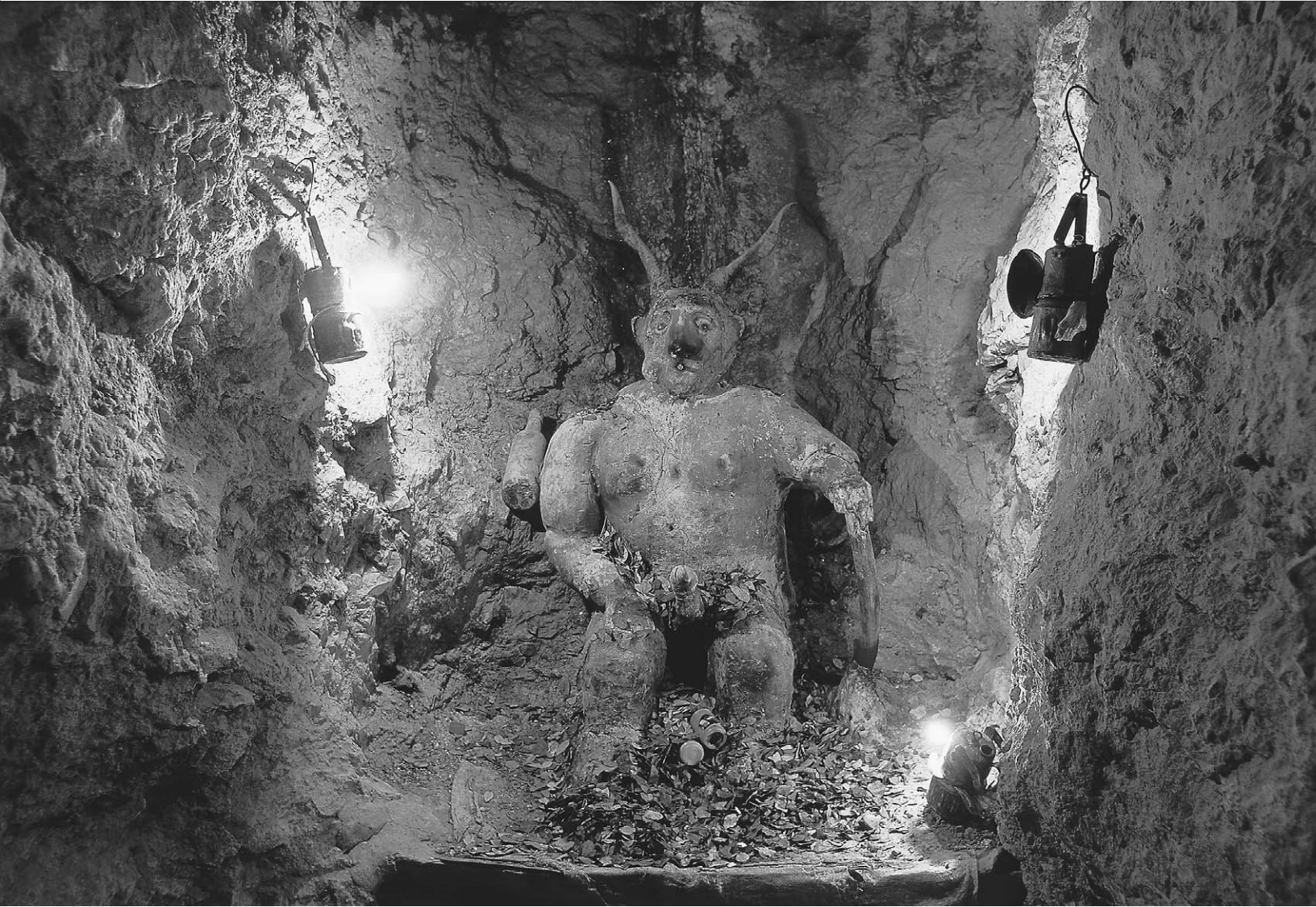
FIGURE 1 One of many tíos in a Potosí mine. According to Estenssoro Fuchs (2003, pp 105–110), Quechua lacks a true synonym for “devil,” or “evil being.” Supay initially meant “phantom,” or “shade,” ie the spirit of a dead person said to counsel the living so that they might find peace through proper deeds. Opposition to and diabolization of supay was the result of the politics of translation amid changing conditions of evangelization.

attendant ceremonies and rites, mean? What are the implications for understanding the natural and social order of mountain societies? What are the relationships between the mythic and religious practices and the sometimes highly controversial politics of development? These questions and issues are treated here in several steps. (1) First, a key anthropological model is introduced for the study of these questions, along with basic notions of Andean conceptions of space which belong to the mythical-religious realm. (2) The next section explores the time dimension of this realm by summarizing selected origin myths and pointing to their relevance for understanding the relationship between the mountainous landscape and its human inhabitants. (3) The third section briefly summarizes the historical formation of this complex under Spanish domination from the 16th to the early 19th centuries. (4) This his-