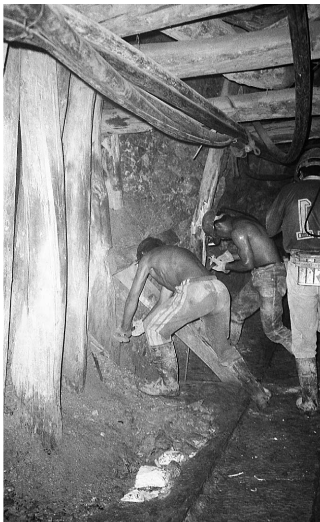
FIGURE 3 Miners in Cerro Rico (4200 m), Potosí. Working conditions in Bolivian mines are barely tolerable, taking a huge toll on men's lives. Dust, heat, lack of air, noise, the sheer weight of the stones extracted for silver, tin, or lead, and very long working hours are made bearable only by chewing coca leaves. Yet mining is the only source of income for many families in the area.