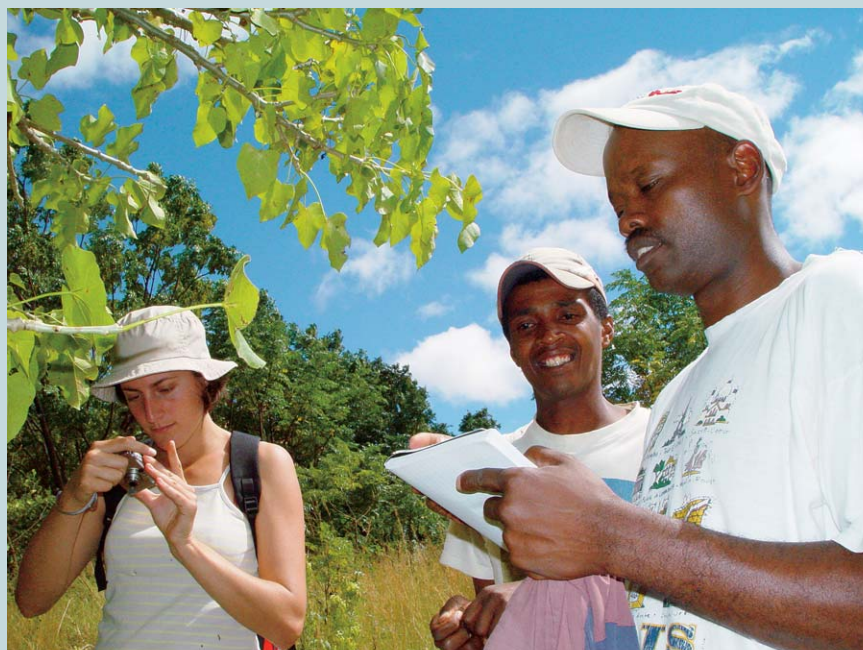
FIGURE 5 Research and development on the botanical circuit in Anjà. Villagers work together with a national botanist and international students.

a leader with a vision of communal economic development.