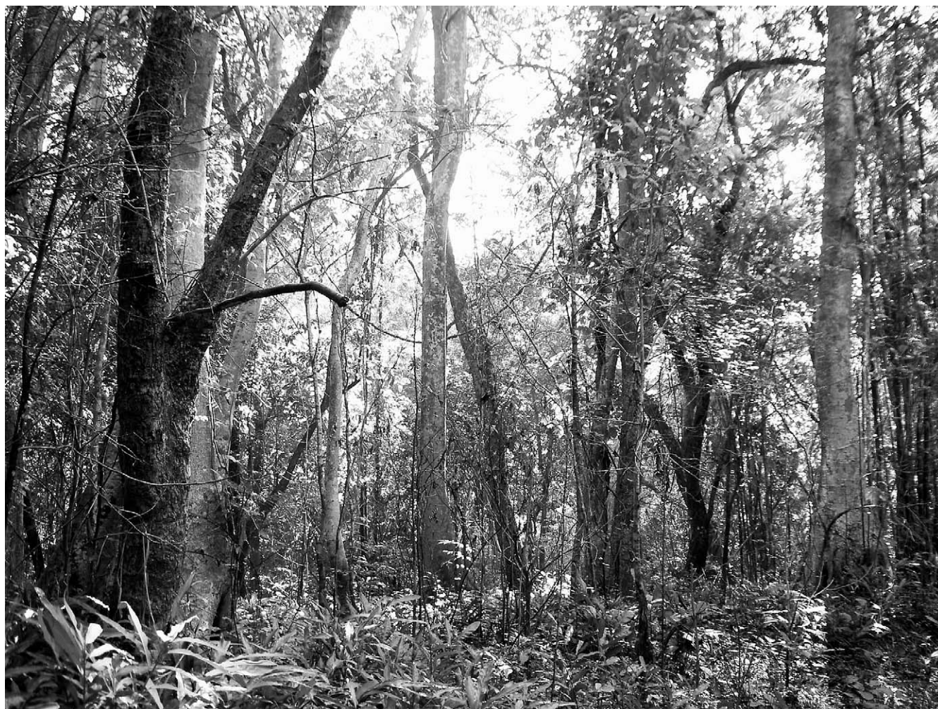
FIGURE 3 An example of the mae la thei kla forest type in the Pwo Karen classification system.

called mae la bon peuh (or mae la bon lo , or also mae la bon ). However, there were some disagreements over the number of years a forest has to be left fallow to be called hui peuh , mae la hui bon , mae la bon peuh , or mae la lom bohn .