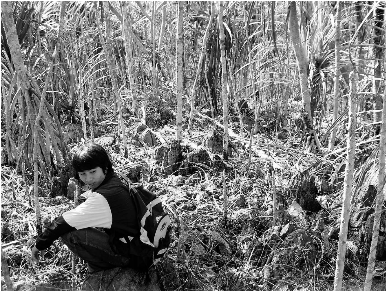
FIGURE 5 An example of the lai kla forest type in the Pwo Karen classification system.

slope. The forest categories here are more akin to the ecological zones or habitats found in international conventions, with some variations.