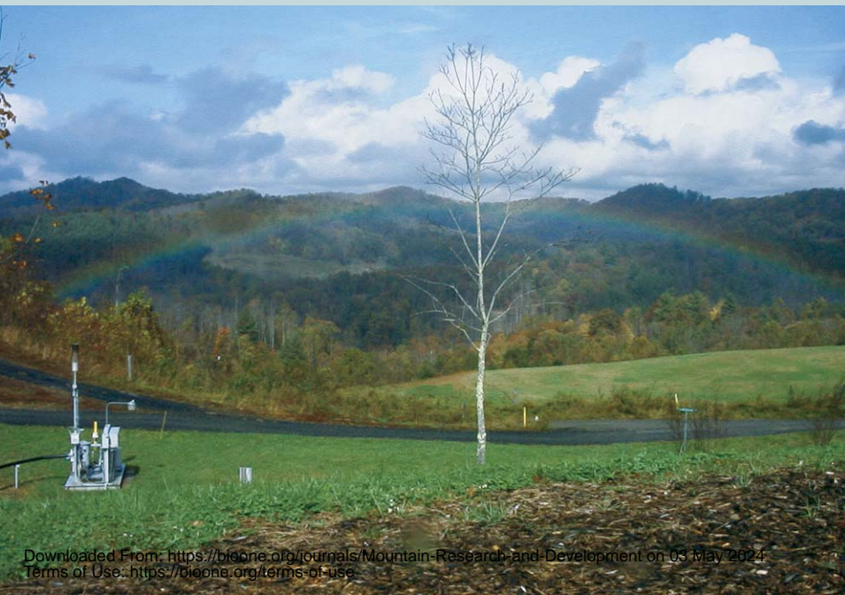
FIGURE 2 Capped landfill with methane recovery operation in Yancey County, North Carolina.

Numerous local governments, in partnership with complementary agencies, economic development authorities, and the private sector, are beginning to develop landfill methane projects (Figure 2). Solid waste landfills produce methane gas as a by-product of decomposition, which can be captured for productive uses. The stories of two of these illustrate the place-specific challenges and opportunities they afford. In Yancey County, North Carolina, beneath the Black Mountains—eastern America’s highest—the Energy Xchange business incubator supports heritage crafts studios, green houses, and an education center. Arts and crafts in the moun-