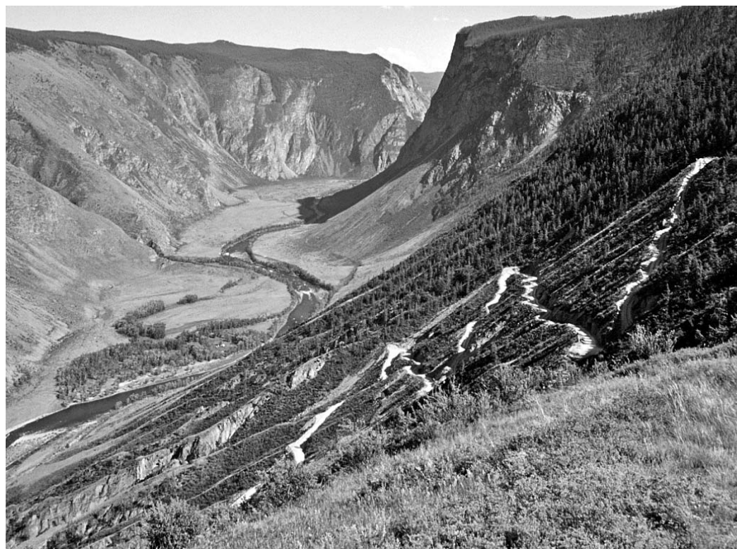
FIGURE 1 Chulyshman River Valley, showing a new road facilitating increased tourist access.

Dealing with the natural and social effects of the rapid growth of tourism, as well as the impending privatization of land, are the primary concerns of the Republic and local-level planning authorities. One of the strategies under development is the establishment of