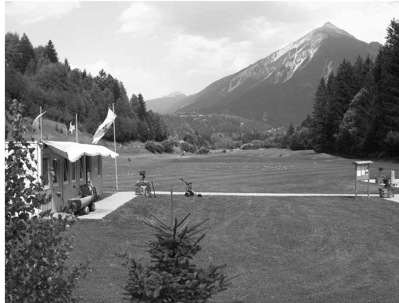
FIGURE 5 Eighteen-hole golf course in Alvaneu Bad.

pole. Some informants nevertheless described how some places became meaningful for them due to personal leisure activities. In their case, the key category remembered leisure activities lies close to the individual pole.