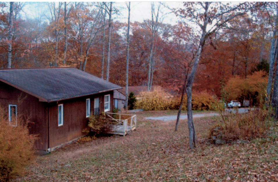
FIGURE 2 The first Land Trust house, designed by the Federation of Appalachian Housing Inc. The lower house on the right is a typical Tennessee Valley design. Mortgage financing for the Land Trust house came from the Churches.

“When poison escapes from the mines, the birds die and we humans take heed to fix the problem so that we may live. We who live in coal mining areas are, for our nation, what the bird is to the coal mining community. We belong to Earth. Earth does not belong to us. We are preparing for a post-industrial era and how we fade in and out of the real world is a challenge to all of us who dare to get involved.”