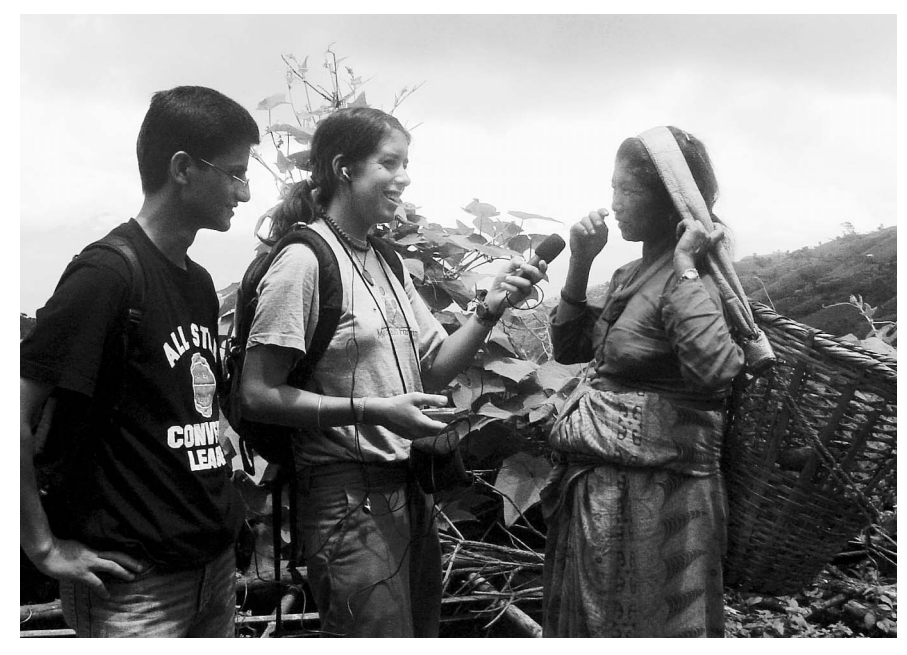
FIGURE 1 Interviewing a Tamang woman. Bhojeni, Kathmandu District, Nepal.

In the first phase, 8 such programs will be produced. As this is a pilot phase, the purpose is to assess whether such an approach—which