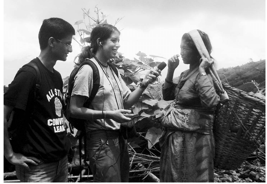
FIGURE 1 Interviewing a Tamang woman. Bhojeni, Kathmandu District, Nepal.

In the first phase, 8 such programs will be produced. As this is a pilot phase, the purpose is to assess whether such an approach—which