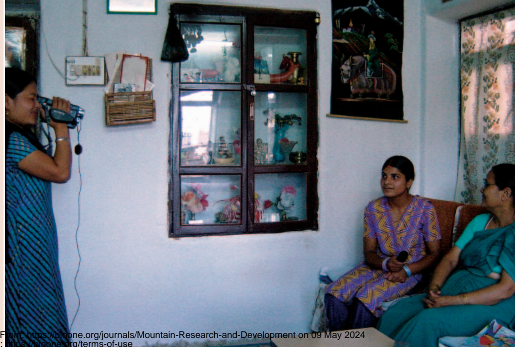
FIGURE 4 Two young producers film and conduct an interview as part of Jeevanko Goreto (Path of Life). The CMC's focus is on youth, and young women constituted a majority of the 174 participants that the CMC trained in the first year of the program.

Direct access to the Internet is also opening up new ideas and spaces for exploration. After a computer training program for 30 housewives, a handful of women have started using email to keep in touch with family members abroad. They also search the Internet for new recipes and hair styles to put to use in small businesses. To address the lack of good materials available in masters-level programs, the CMC is introducing a specialized course for local campus lecturers on searching and using the Internet.