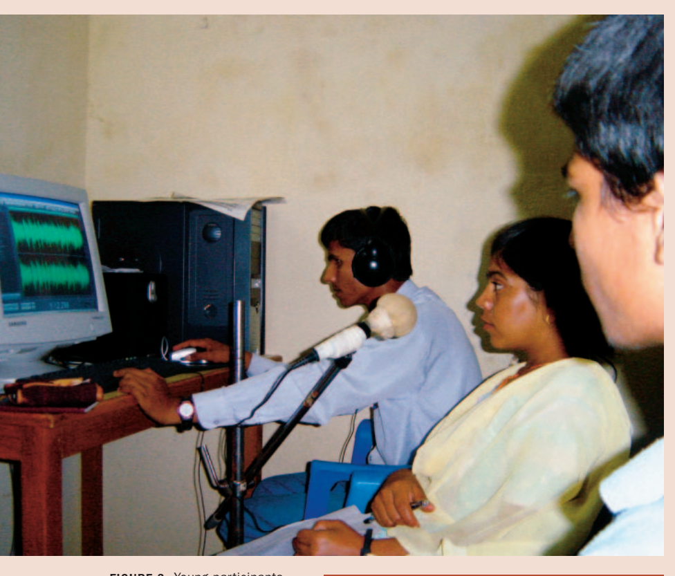
FIGURE 3 Young participants learn to edit audio in the CMC's makeshift studio. Remarkably, Tansen boasts no less than 3 FM radio stations in the town itself.