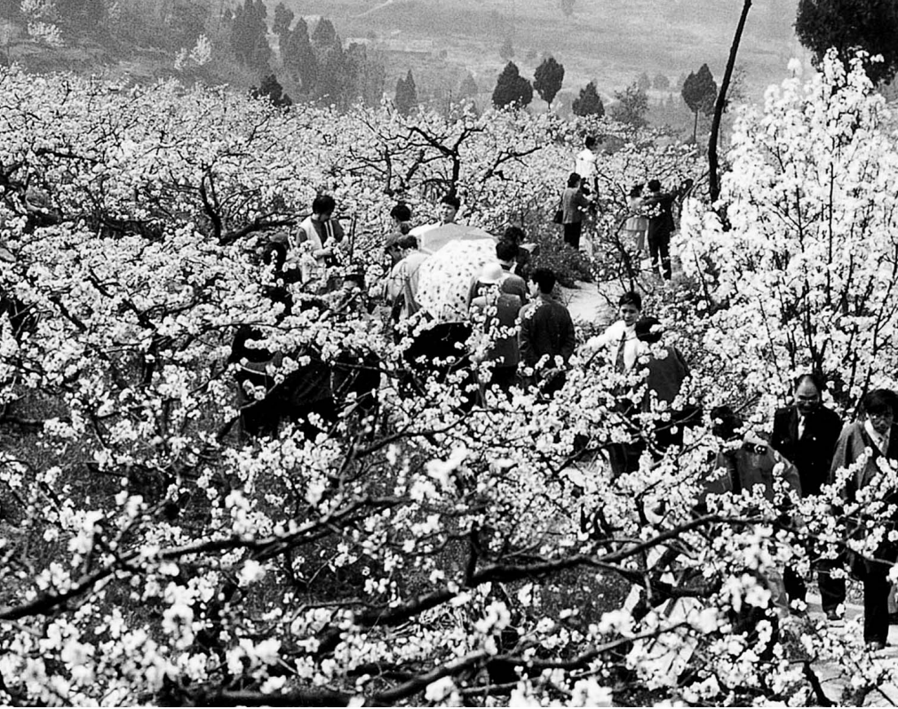
FIGURE 2 Urban visitors pour into Longquanyi County during the peach blossom season.

Rural tourism began as family businesses run by local farmers. Most employees are relatives. Local farmers usually manage several businesses concurrently. For example, besides tourism, they may also grow plants in nurseries, fruit trees in orchards, and run other agricultural operations. With the development of rural tourism, some local urban residents began to operate businesses by renting land from local farmers. It is estimated that about 20% of the operators are not local farmers in Chengdu. Generally their operations are larger and their facilities better than those of the local farmers.