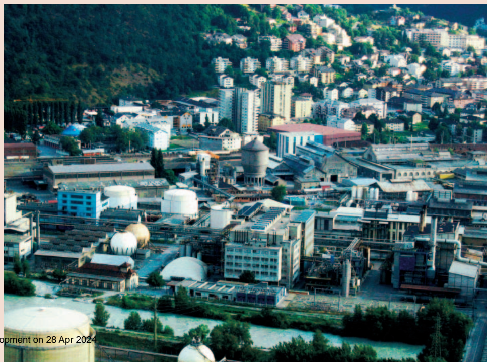
FIGURE 4 Visp, Switzerland. Industrial specialization and better access to major agglomerations also increase the outward orientation of small Alpine towns.

support for this role is justified. On the other hand, there is also an awareness that this role alone will not be sufficient to ensure the regional future. In other words: "Because our production systems are being continually renewed, professional qualifications are increasing and new opportunities are available to young people" ( network ), and "Local roots, identity, and quality of life still keep people in the