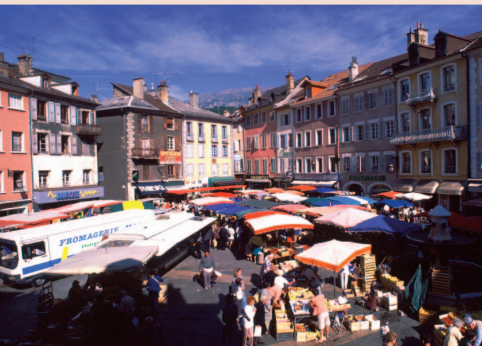
FIGURE 5 Gap, France. Given its dual function in serving the regional population as well as tourists, the local market in Gap offers high quality to both.

villages; our urban center supports this” ( supply ).