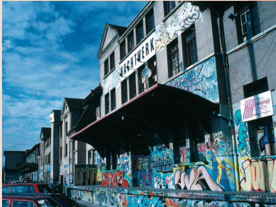
FIGURE 3 Thun, Switzerland. Informal (and later commercial) transformations of industrial blights into recreational and cultural areas have triggered supraregional ambitions.

support for this role is justified. On the other hand, there is also an awareness that this role alone will not be sufficient to ensure the regional future. In other words: "Because our production systems are being continually renewed, professional qualifications are increasing and new opportunities are available to young people" ( network ), and "Local roots, identity, and quality of life still keep people in the