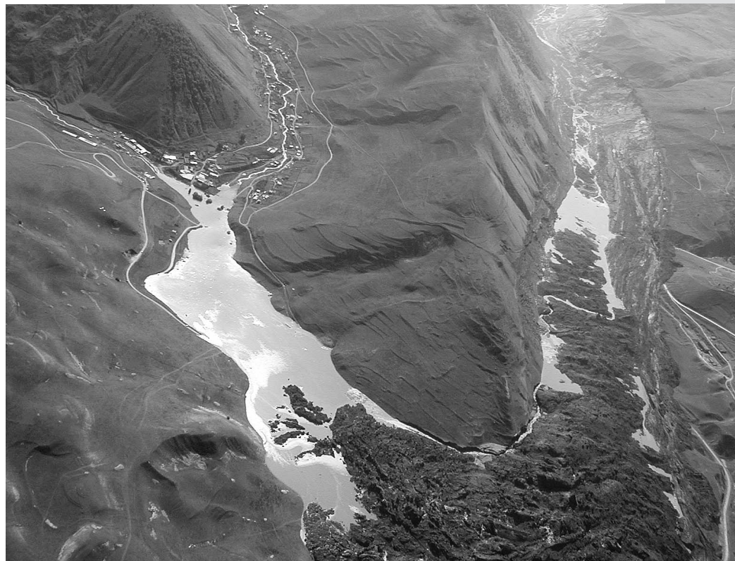
FIGURE 4 View of the mass blocked by the Skalistyi Ridge, and of the rising lake near Saniba.

Indeed, the Upper Karmadon thermal springs, with a temperature up to 60°C, are situated not far from the end of the Maili Glacier. Therefore, one can hypothesize the existence of special thermal conditions under the glacier that may have initiated its melting from underneath, thus forming a water “cushion” on its bed. This would have accelerated the glacier surge. It should be noted that during the 9 years of monitoring in the 1970s, no signs of gas emission were observed.