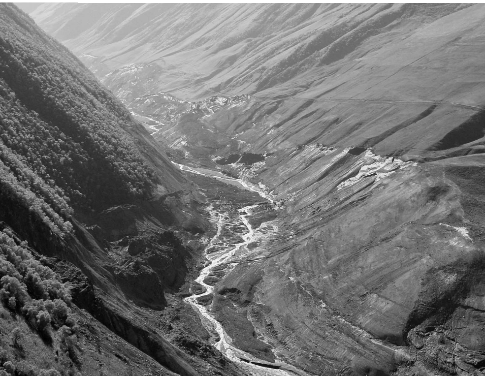
FIGURE 3 Traces of the “waves” left by the glacial debris flow on the slopes of the Genaldon valley. Some reach a height of 140 m.

violently within the boundaries of the Karmadon depression, partly on the Skalistyi Ridge and especially on its Gizel part. (Rototaev et al 1983)