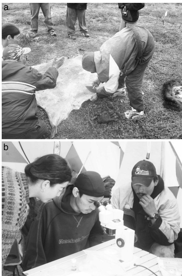
FIGURE 2. The arctic field ecology youth-elder-science camp involved such diverse activities as (a) stretching hides of caribou recently harvested by the elders and (b) observing microscopic soil invertebrates.