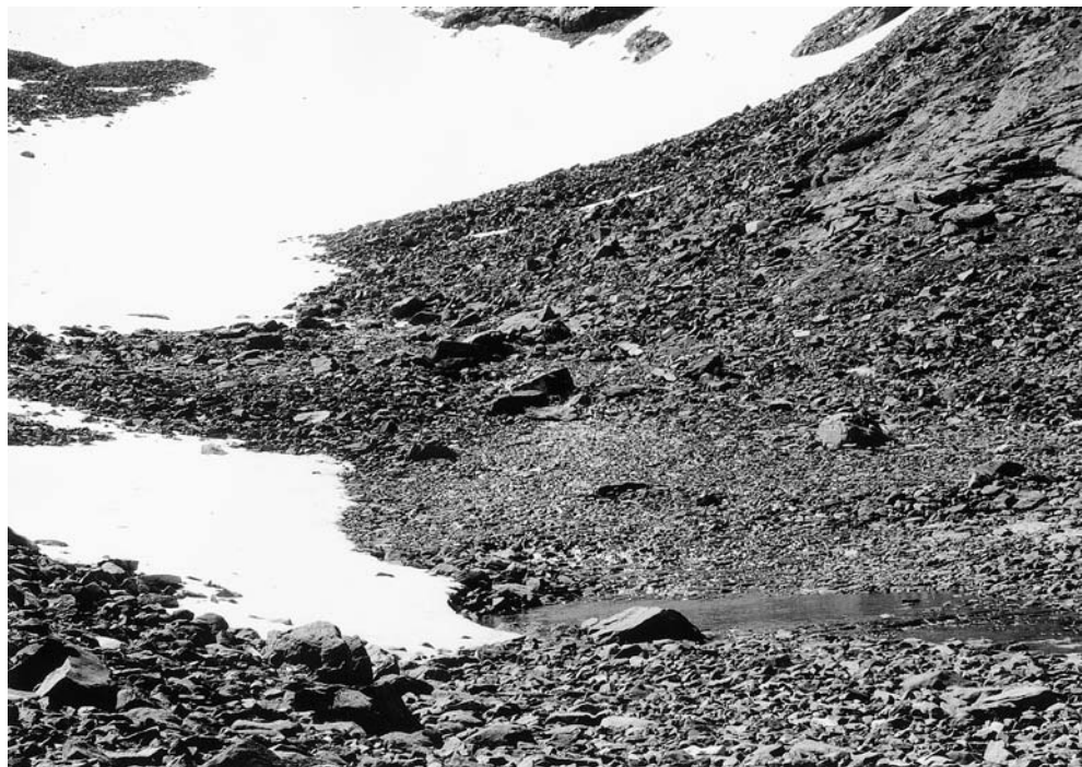
FIGURE 7. The birch trunk displayed in Figure 6 was discovered at the left hand margin of the lower snow patch. Photo: L. Kullman, 18 July 2002.

total elevational shifts of the tree-limit during the Holocene could be made.