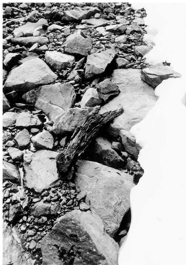
FIGURE 6. Detrital birch trunk emerging close to the snow margin, and dated 7970 \pm 50 B.P. (Site 1). Photo: L. Kullman, 18 July 2002.

Most of the recovered wood pieces were visibly exposed on the ground surface, i.e. without a stratigraphical context, among angular blocks of various sizes and trickling meltwater (Figs. 6, 7). A few were more or less concealed beneath newly established and living moss carpets in minor deltas of proglacial lakes (Fig. 8). All sites of wood deposition were obviously of secondary nature, and the wood can be characterized as detrital, i.e. it has been transported there from higher original growing locations, by slides, avalanches, or subglacial/subnival fluvial action. Thus, only minimum estimates of