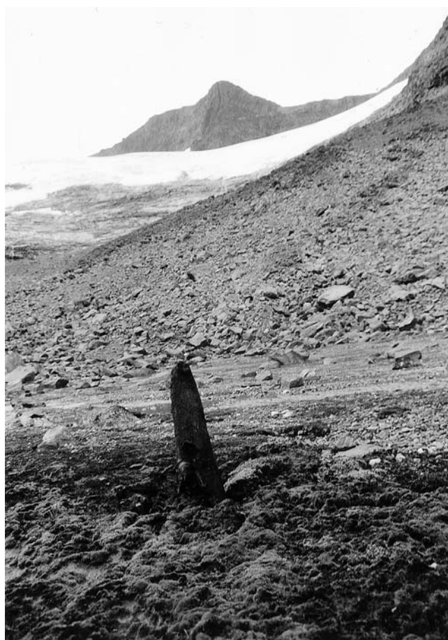
FIGURE 8. Large piece of a birch trunk uncovered close to the inlet into the proglacial lake below the glacier Storsylglaciären (Site 2). This specimen has been raised from its original position beneath a fairly recent moss cover. Radiocarbon-dating yielded an age of 6220 \pm 80 B.P.. Photo: L. Kullman, 22 August 2001.

In principle, the vertical difference between the highest postglacial birch record and the present-day tree-limit position, i.e. 630 m, may represent decrease of birch-relevant (summer) temperatures by 3.8°C, applying a crude elevational lapse rate of -0.6^{\circ}\text{C} for 100 m altitudinal increase (Laaksonen, 1976). Tentative correction for glacioisostatic land-uplift (Dahl and Nesje, 1996) reduces this figure to ca. 3.0^{\circ}\text{C} . This calculation suffers from some uncertainties, e.g., possible spatial and temporal variations of the lapse rate (cf. Mook and Vorren, 1996) and the vertical incoherence of the upper birch distribution during the early Holocene. Nonetheless, this lapse rate–based reconstruction gains in credibility by the finding that a maximum of 140 m birch tree-limit rise during the past century corresponds to 1^{\circ}\text{C} summer warming (see