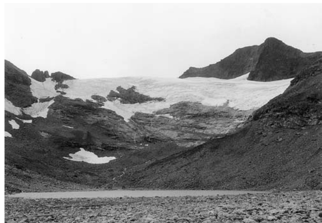
FIGURE 2. The Sylarna Mts. and the glacier Storsylglaciären viewed from the northeast. In the first decade of the 20th century, the lowest glacier tongue extended to about 25 m above the proglacial lake (1275 m a.s.l.) viewed in the foreground (Enquist, 1910). Site 2 is right at the inlet of the main meltwater stream to this lake. Photo: L. Kullman, 22 August 2001.

The Sylarna Mountains were selected as a suitable test area as they offer a multitude of different physiographic settings at sufficiently high elevations, in combination with the presence of small and currently wasting glaciers and perennial snowfields.