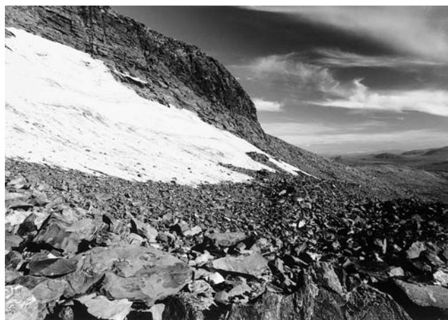
FIGURE 5. The uppermost sampling site (no. 3) was at 1500 m a.s.l. Subfossil birch remains were recovered here within the nearest 30 m from the snow fringe. Complete absence of lichens and mosses suggest that late summer thawing of this zone is highly exceptional. Photo: L. Kullman, 21 July 2002.

(Syltjärn), 1275 m a.s.l. Megafossil wood was deposited here, probably from nearby steep east- and southeast-facing slopes and is more or less covered by a thin moss layer of fairly recent origin.