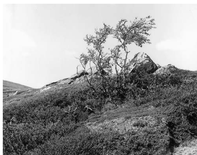
FIGURE 3. The nearest present-day tree-limit of mountain birch, east of the river Sylälven, 920 m a.s.l. Growth to tree-size of these stems was initiated during the warming peak in the late-1930s. Photo: L. Kullman, 5 August 1977.

Present-day comparisons with historical terrain photographs from 1908 (Enquist, 1910) and up to the present day reveal areal reduction of the existing glaciers by about 50% (Lundqvist, 1969; Kullman 2003a)