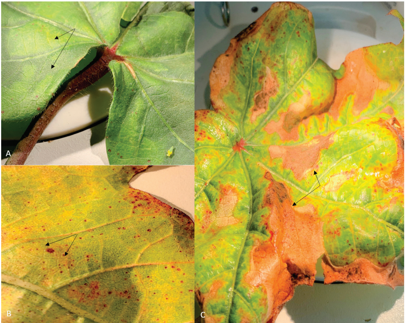
Fig. 1. Damage of Amrasca biguttula in cotton leaf: A) chlorosis and discoloration, B) reddening point, and C) burn areas.

L. [Malvaceae]], eggplant ( Solanum melongena L. [Solanaceae]), cowpea ( Vigna unguiculata L. [Fabaceae]), pigeon pea ( Cajanus cajan Mill-sp. [Fabaceae]), potatoes ( Solanum tuberosum L. [Solanaceae]), millet ( Sorghum sp. [Poaceae]), maize ( Zea mays L. [Poaceae]), and sunflower ( Helianthus annuus L. [Asteraceae]) and is reported to have many additional ornamental hosts in its native range in Asia such as china rose ( Hibiscus rosa-sinensis L. [Malvaceae]) and Bermuda grass ( Cynodon dactylon L. [Poaceae]) (Kamale & Sathed 2015; Saeed et al. 2015). The genus Gossypium , from which cultivated cotton was domesticated, is native to both the Eastern and Western Hemispheres; however, the genus Amrasca is endemic to the Indomalayan region (Dmitriev et al. 2022). Due to the widespread cultivation of cotton, this non-native species ( A. biguttata ), when introduced to a new site, may have the potential to reproduce and disperse without control, potentially causing significant economic impact. Perhaps the observed increase of this pest in the reported crops is because it does not have local natural enemies, as predicted by the enemy release hypothesis (Middleton 2008). There is the potential for this to occur in Puerto Rico, with additional challenges unique to island ecosystems.