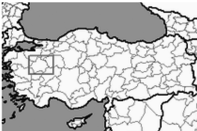
Fig. 3. Location of Kütahya province in Turkey.