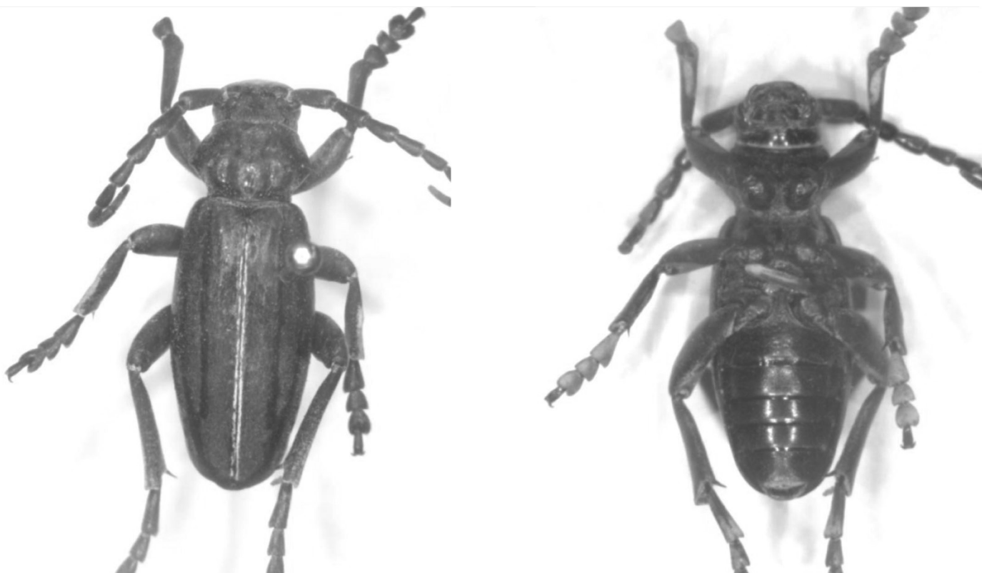
Fig. 1. Megalodorcadion nundefasciatum sp. nov. (holotype ♂).

Elytra with very dense, recumbent, dark-brown ground pubescence; each elytron with two glabrous bands as humeral and dorsal, and a distinct sutural band of white pubescence; glabrous bands complete; dorsal band separated from humeral band but joined at the end; elytra laterally glabrous; elytral apex without setae, flattened and rounded, reddish-brown.