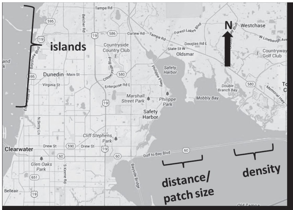
Fig. 1. Map showing overview and relative location of each of the 3 studies. Tampa (Hillsborough County), Florida is to the east.

east side of the CCC bridge is an extensive area of B. frutescens forming a continuous ground cover matrix with I. frutescens shrubs emerging intermittently, such that the distance between the host species is zero; moreover, relative host plant abundances vary with varying Borrchia stem density (Fig. 2). Monthly gall counts were performed from Jan 2009 to Sep 2009 to determine gall densities on I. frutescens and B. frutescens . Additionally, areal density of potential oviposition sites (leaf buds) on Borrchia on both sides of each I. frutescens shrub in the study was measured and the local average determined. Emergence holes were counted concurrently on both species and classified according to whether they were the result of emerging gall midges or parasitoids (Stiling & Rossi 1997). Linear regression analysis was performed using I. frutescens gall density and parasitism rate as response variables and B. frutescens gall density, oviposition site areal density and parasitism rate as independent variables influencing Iva gall density. We predicted Iva gall density to be lower and parasitism rate higher as Borrchia gall density, oviposition site density and parasitism rate increased.