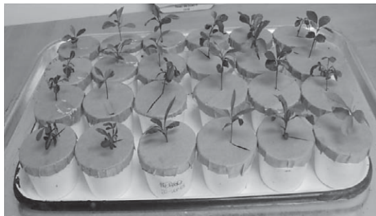
Fig. 2. Styrofoam pots covered with brown paper to prevent contact between the insect and the ground. A 'Cleopatra' mandarin seedling was grown on Sunshine Peat Moss® in each 237 mL pot. The seedlings infested by placing the pots into a cage with Diaphorina citri .

For the first method, 'Cleopatra' mandarin ( Citrus reshni Hort ex Tan.) seedlings growing on Sunshine Peat Moss® (Sun Gro® Horticulture, Vancouver, Canada) in styrofoam pots of 237 mL were inoculated. The pots were covered with brown paper to prevent contact between the insect and the ground (Fig. 2). Then the seedlings were placed for 72 h in reproduction cages of 48 × 48 × 60 cm. to induce a natural infestation. After this time, seedlings with at least 10 actively feeding adult psyllids were selected and placed individually into a bioassay chamber. Once the chamber was closed and sealed, the seedlings pre-