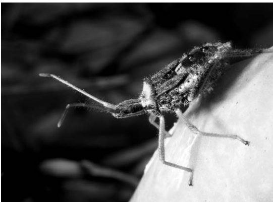
Fig. 1. Narnia femorata at the fifth instar.

At 10 weeks post-hatching, juveniles reared with fruits were significantly further along in their development than those reared without fruits ( \chi^2 = 29.745 , df = 1 , P < 0.001 ) (Fig. 2). In fact, 35 of the 37 surviving insects from the cla-