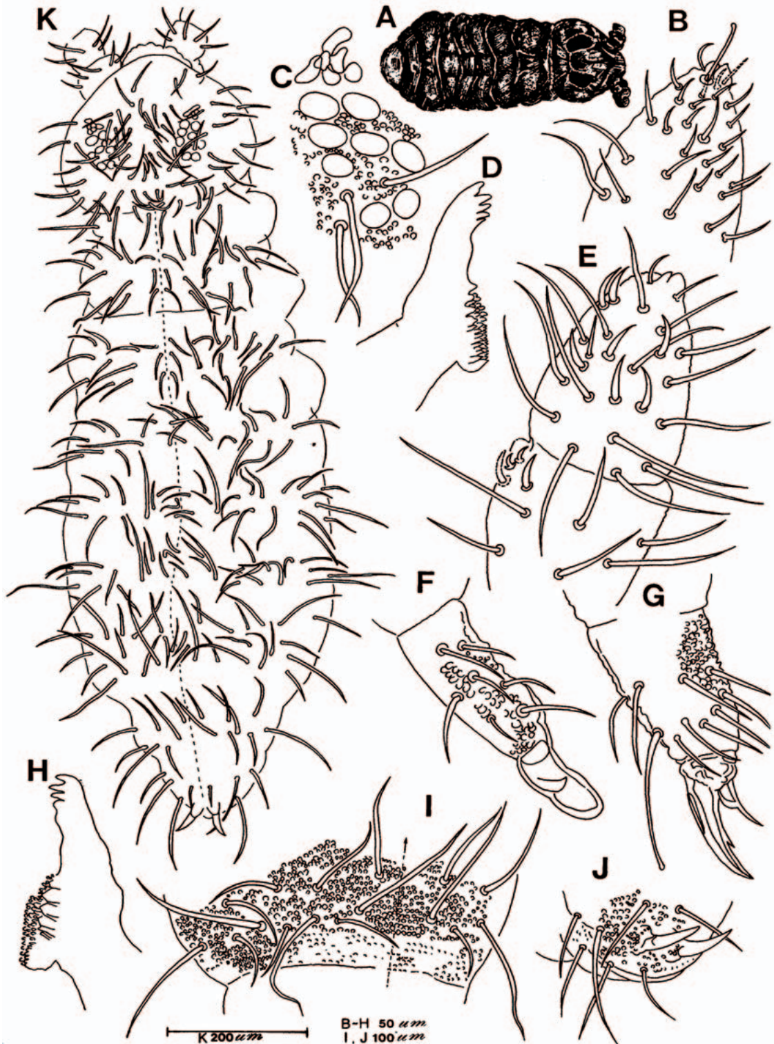
Fig. 2. Ceratophysella platyna n. sp. A. Habitus. B. Ventral view of antenna IV segment. C. Postantennal organ (PAO) and 8 ocelli. D. Left mandible. E. Dorsal view of antenna IV segment. F. Dorsal view of mucro and dens. G. First leg. H. Right mandible. I. Abdomen V segment. J. Anal spine. K. Dorsal chaetotaxy of body.