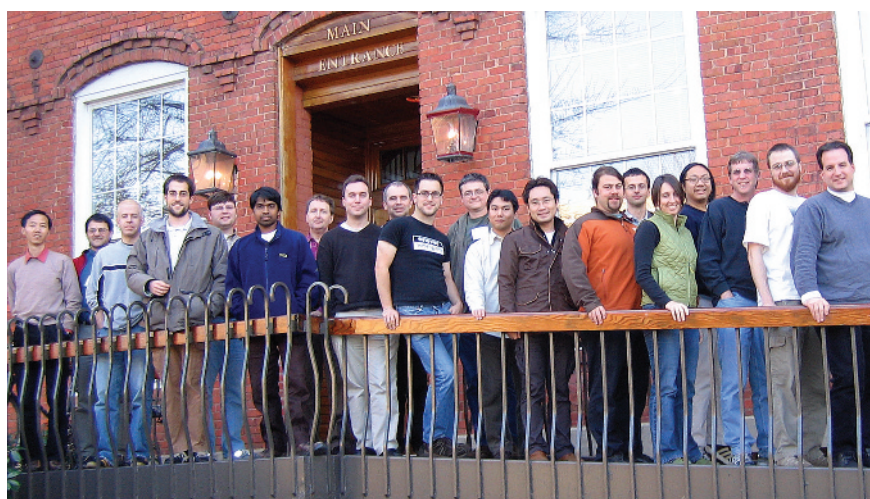
The programmers and biologists who attended a five-day “phyloinformatics hackathon” stand outside the old Erwin Cotton Mills building, now home to NESCent.

Just over two years ago, the National Science Foundation (NSF) established NESCent, granting $15 million over five years to foster and encourage what it termed “a grand synthesis of the biological disciplines through the unifying principle of descent with modification.” The intent: Do for evolutionary biology what