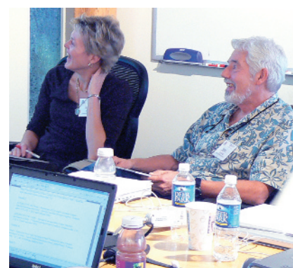
Fall colors are evident outside the window as the working group, “Towards an Integrated Database for Fish Evolution,” meets inside one of NESCent’s conference rooms (top).