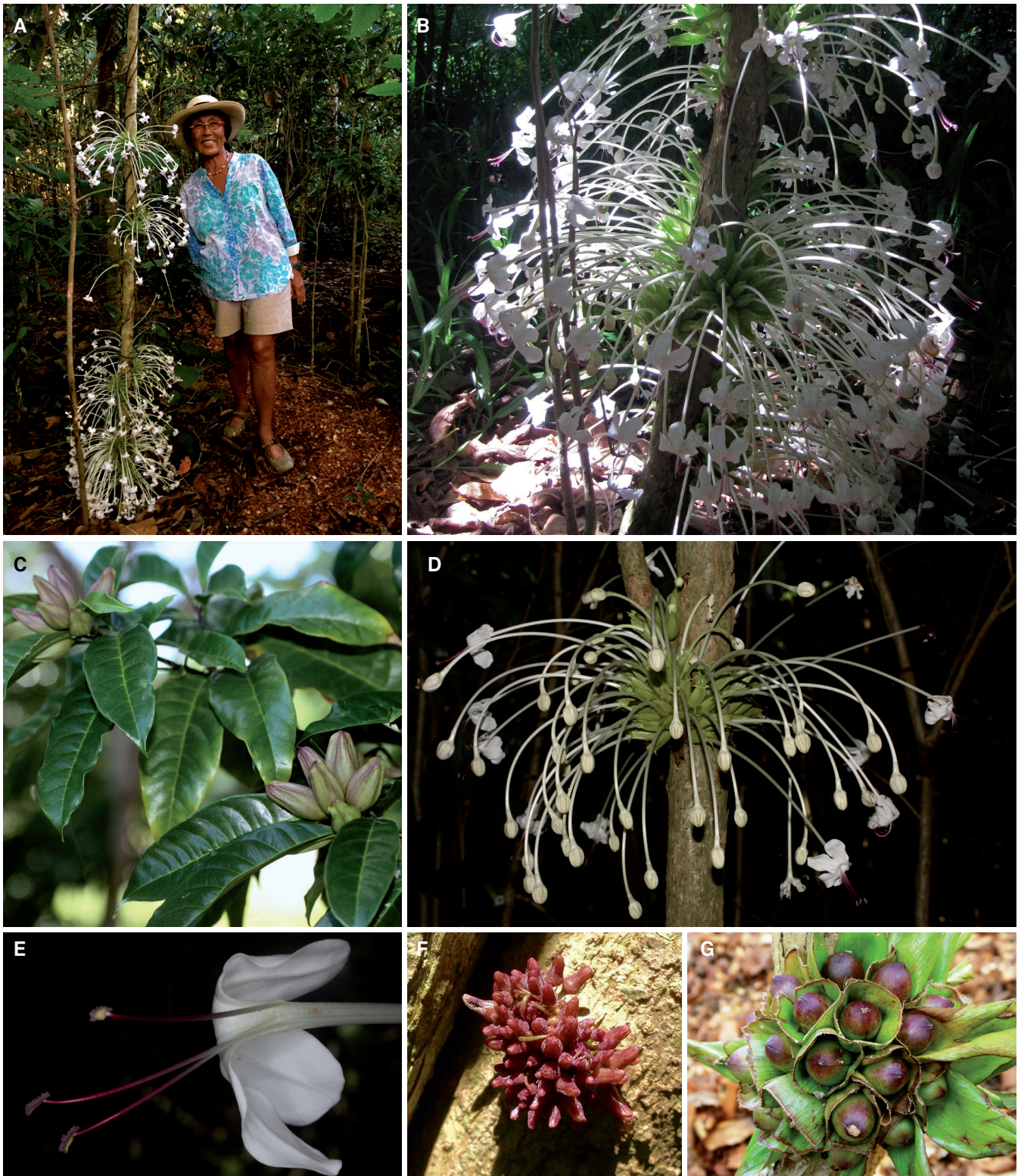
Fig. 2. – Photographs of Clerodendrum kamhyode Phillipson & Allorge. A. Marie Hélène Kam Hyo Zschocke standing with a young flowering individual; B. Trunk with inflorescences; C. Young shoots bearing occasional terminal inflorescences; D. Young inflorescence showing pre-anthesis buds tinged dull purple-brown and open flowers; E. Bisected flower showing insertion of stamens; F. Young flower buds with caducous bracts visible; G. Developing fruits (upper part of calyx removed).