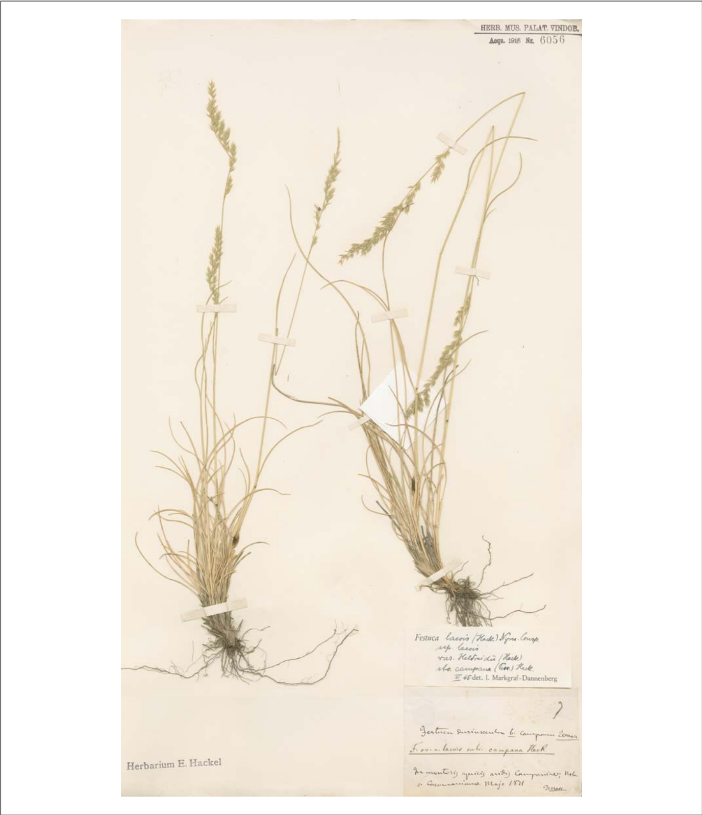
Fig. 2. – Lectotypus of Festuca duriuscula var. campana N. Terracc. [Terracciano s.n., W]