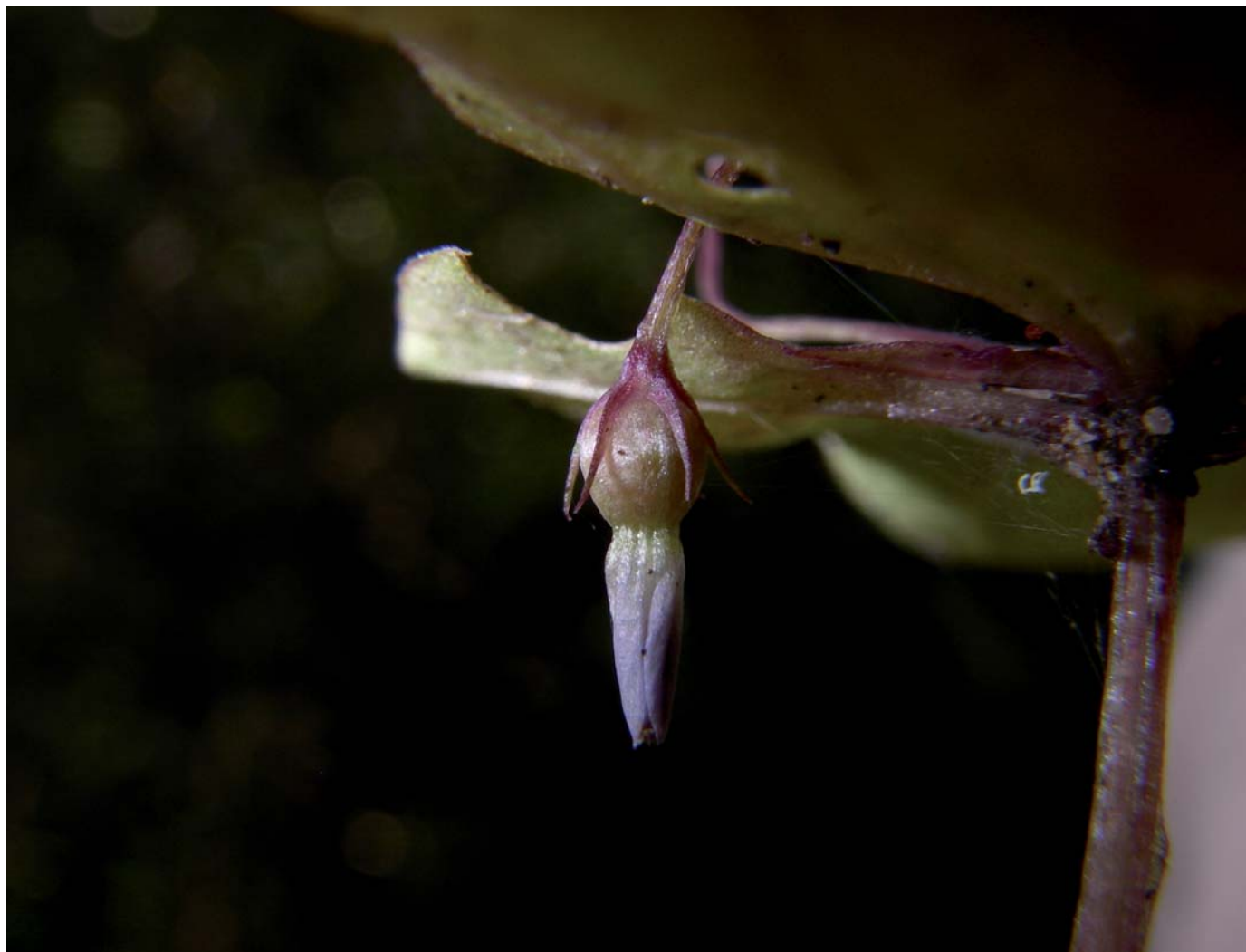
Fig. 4. – An autogamous flower of Exacum alberti-grimaldii Wohlh. & Callm. showing the unwinged sepals. [Wohlhauser & Bongary 803]

generally simple condensed cymes inflorescences, if composed 7-15 flowers per umbellule; pedicels (15-)25(-36) mm, erect at maturity, possibly cleistogamous (then reflected below the leaves). Calyx 5-lobed, the lobes shortly fused at base ( < 1/5 of the length), 1.5-2.5 mm, linear, not winged, acuminate, accrescent in fruit. Corolla 5-lobed, light blue, white in throat, fused in the lower fourth, 2-3 \times 1-1.5 mm, obovate, obtuse, acuminate, when withered with lobes forming a cone at the top of the capsule, accrescent. Stamens 2-3 mm long; anthers c. 1 mm, yellow, rectangular, curved and slightly narrowing towards the apex, without papilla near the apex, opening by pores that later widen to slits along up to 1/2 of the anther length. Styles as long as the stamens. Fruit a sub-spherical capsule, 1.5-2 mm in diam., coriaceous, with accrescent sepals appressed to the distal part of withered corolla, septically 2-valved with the partial septum.