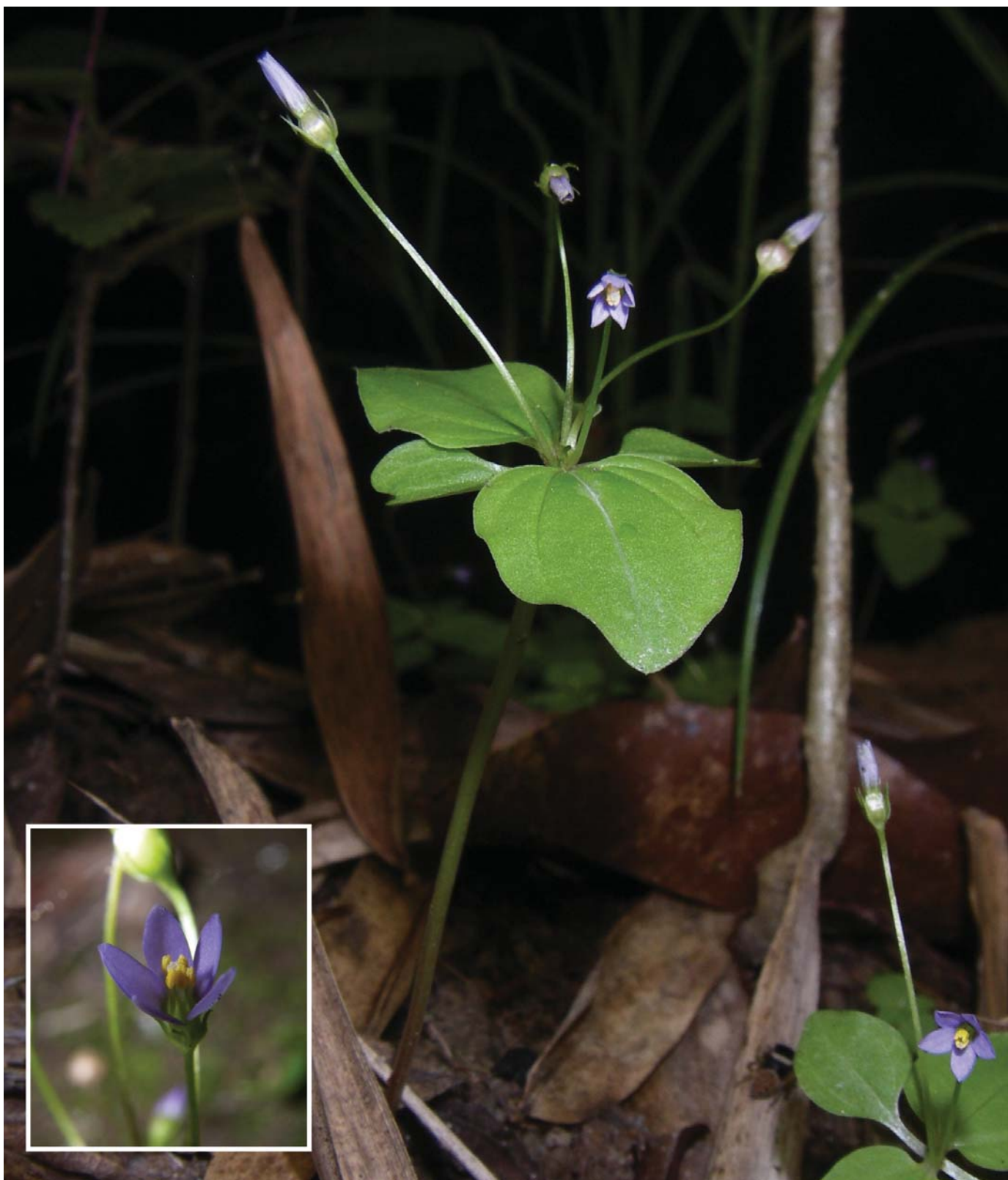
Fig. 3. – Flowering plant of Exacum alberti-grimaldii Wohlh. & Callm. with detail of a flower (framed).

[Wohlhauser & Bongary 803]