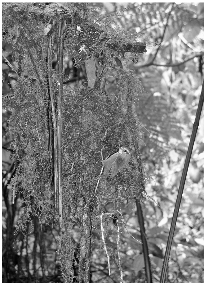
FIGURE 1. An adult White-browed Spinetail ( Hellmayrea gularis ) perched outside the entrance of a nest just after feeding nestlings in southeastern Ecuador.

species to Cranioleuca (Braun and Parker 1985, García-Moreno et al. 1999), or to form part of a clade including other synallaxine genera ( Anumbius , Coryphistera , and Phacellodomus ; Irestedt et al. 2006), its nest architecture does not support any of these relationships. With the exception of Cranioleuca , the aforementioned synallaxines form a clade based on detailed nest synapomorphies (Zyskowski and Prum 1999), none of which are shared with Hellmayrea . In contrast to Hellmayrea , these synallaxines construct domed nests of dry sticks; some have long entrance tubes, thatch, and lining of pubescent leaves ( Synallaxis ); some are entered from above and adorned with conspicuous objects around the entrance ( Anumbius , Coryphistera ); and some are semipensile with a constricted entrance tunnel ( Phacellodomus ; Zyskowski and Prum 1999). Although it is possible that some of these nest characters are the result of these birds inhabiting dry, open environments, the architecture of Hellmayrea nests is dissimilar in too many respects to hypothesize a sister relationship with the aforementioned genera based on nest architecture.