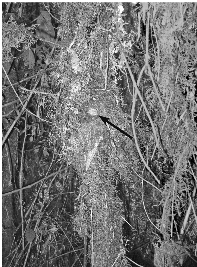
FIGURE 2. A White-browed Spinetail ( Hellmayrea gularis ) nest built into a hanging clump of vines and epiphytes in southeastern Ecuador. The arrow indicates the nest entrance.

The sister relationship between Hellmayrea and Cranioleuca is also not supported by nest architecture. Nests of Cranioleuca spinetails lack bamboo leaves, Tillandsia seed down, and tree-fern scales, and instead incorporate other plant materials, such as woody twigs, rootlets, bark strips, and grass (Remsen 2003; KZ, pers. obs.). Although pensile mossy nests of some