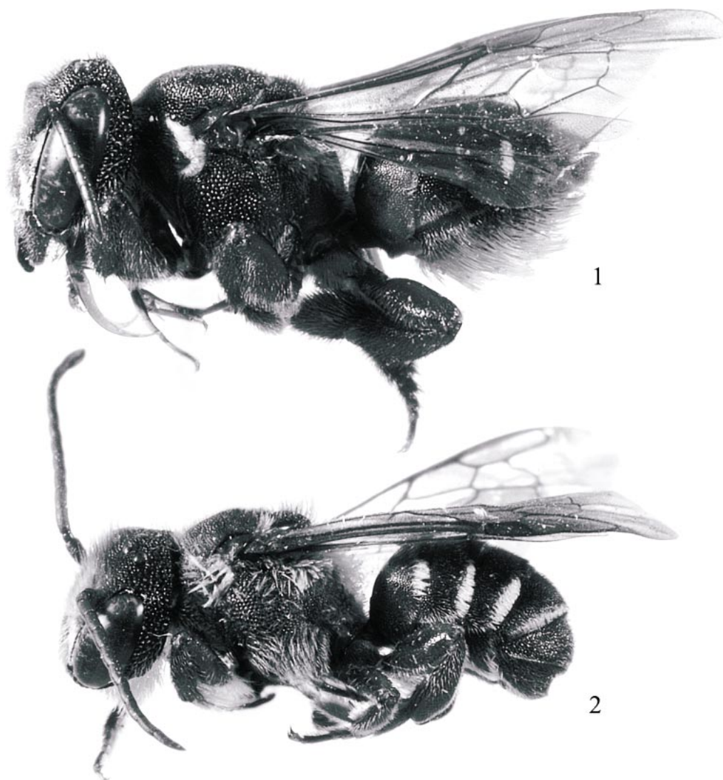
Figs. 1–2. Photomicrographs of Megachile (Matangapis) alticola Cameron. 1. Female, lateral habitus. 2. Male, lateral habitus.

scutellum): width (between tegulae) ratio 1: 0.96. Pretarsal ungues cleft and arolium present on all legs; procoxa unmodified, mutic, anterior surface without cluster of rufescent setae, simply, uniformly pubescent; profemur, protibia, and protarsus unmodified; protarsus slender, with short, even, anterior fringe and longer, irregular posterior fringe; probasitarsus parallel-sided, about three times as long as broad; speculi absent. Mid-legs unmodified, mesotibial calcar present; mesotarsal fringes as described for forelegs.