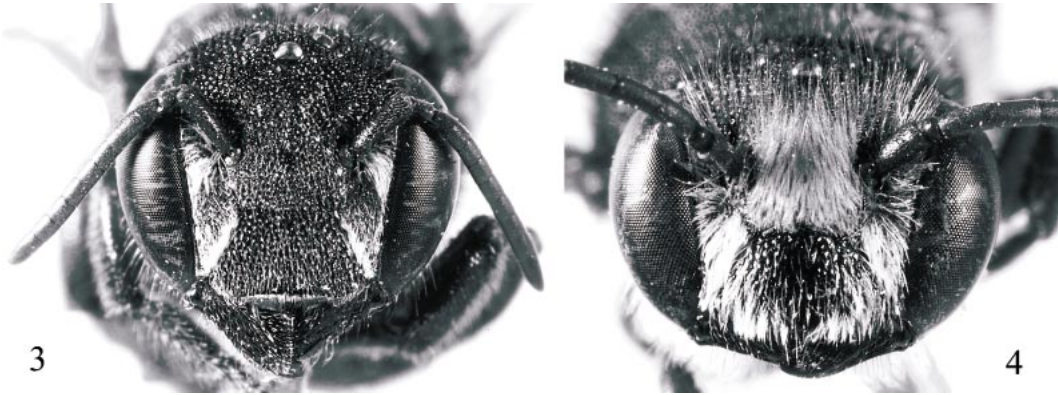
Figs. 3–4. Photomicrographs of Megachile (Matangapis) alticola Cameron. 3. Female, facial view. 4. Male, facial view.

T4; T1 short, its dorsal surface medially not greatly longer than ocellar diameter, thinly clothed with long, erect, pale setae; T2 and T3 weakly punctate; T4 and T5 with weak, postgradular sulci, sulci not fasciate; T6 in median third with weak transverse ridge not forming a distinct carina, in profile tergum concave before ridge, weakly convex beyond it, margin without lateral teeth; T7 short, in profile its dorsal surface concave, ending in a distinct lip that in dorsal aspect occupies median third of its width, ventral surface narrow, apical margin simply arcuate, without