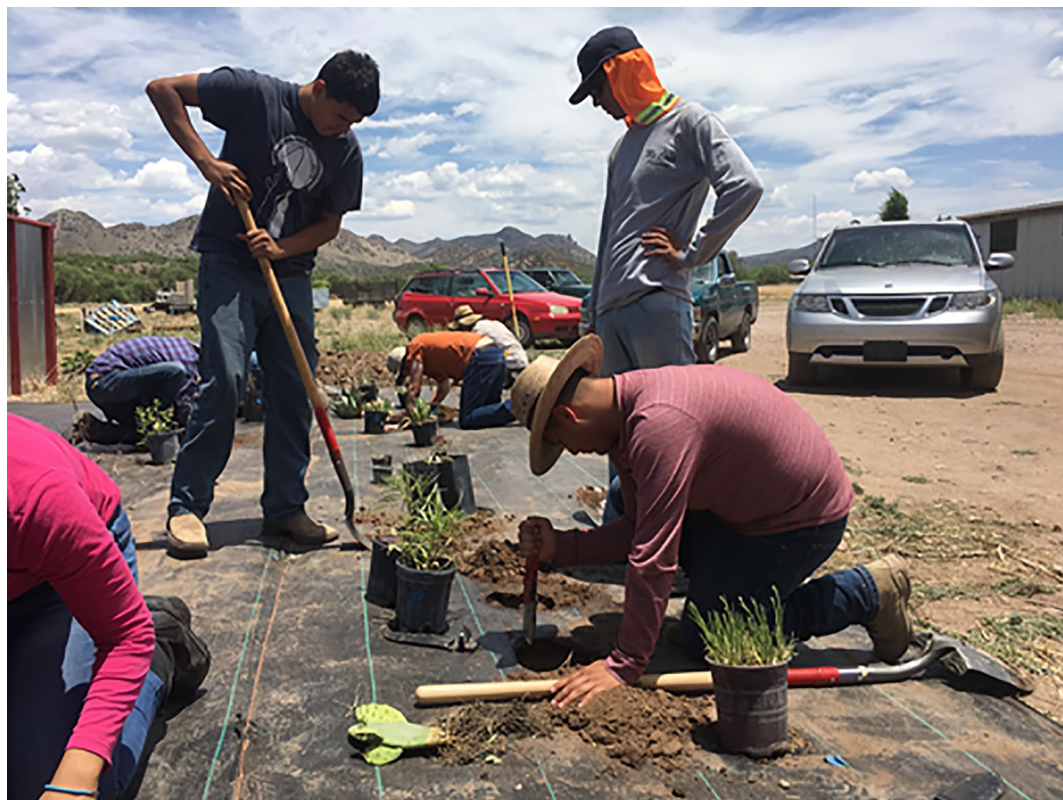
Image 5. BECY crew planting native flowers at Patagonia Flower Farm.