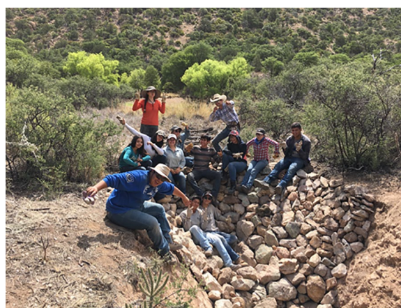
Image 7. BECY with giant Zuni bowl in Dragoon Mountains of Arizona.